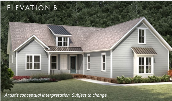
Artist's conceptual interpretation. Subject to change.

STYLE & ELEGANCE are the hallmarks of the Bridgeport. A welcoming front porch and coastal architecture greet you as you enter. Inside, the large great room, dining, and kitchen offer the ideal space for entertaining or family evenings together. The luxurious owners' suite is a lovely retreat after a day boating on the Sound. A back deck and screened porch make outdoor living a breeze. Enjoy the space and flexibility of a bonus room and attached 2-car garage, too.