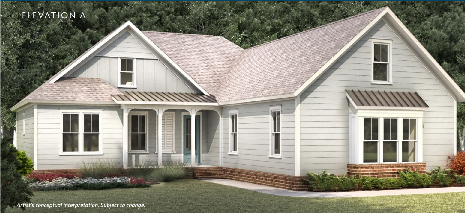
Artist's conceptual interpretation. Subject to change.